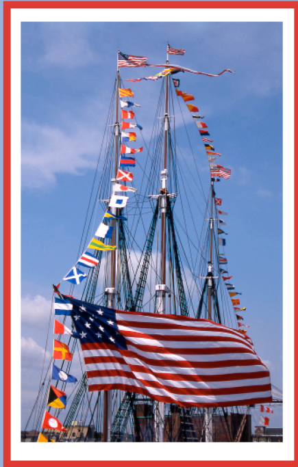
photo courtesy of Ulrike Welsch 1998 "Rigging of USS Constitution on Fourth of July"